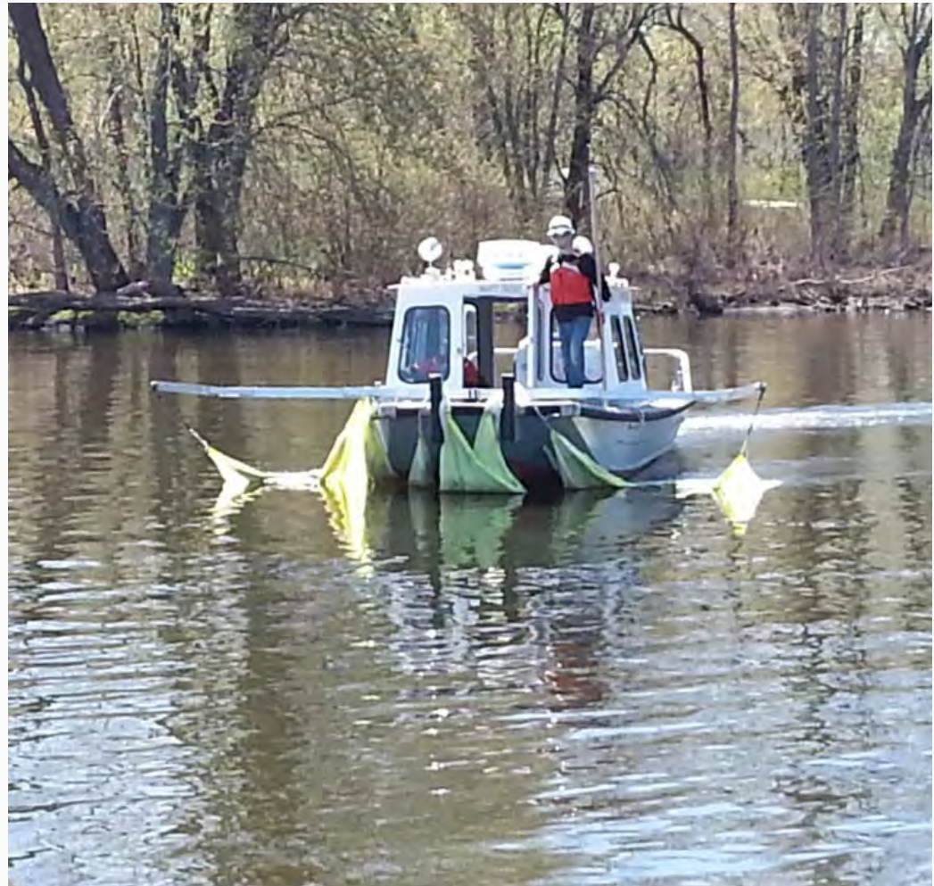
Spill Response Boat