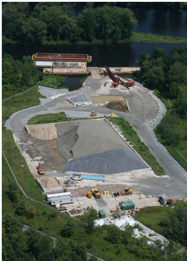
Moreau Backfill Loading Facility