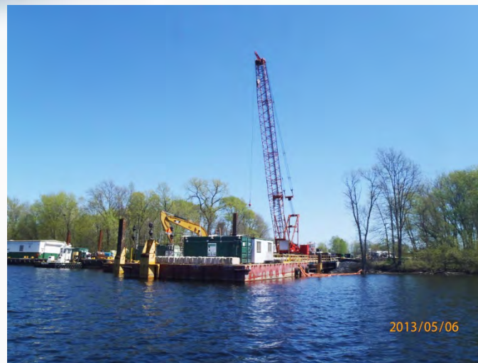
Route 4 Support Property