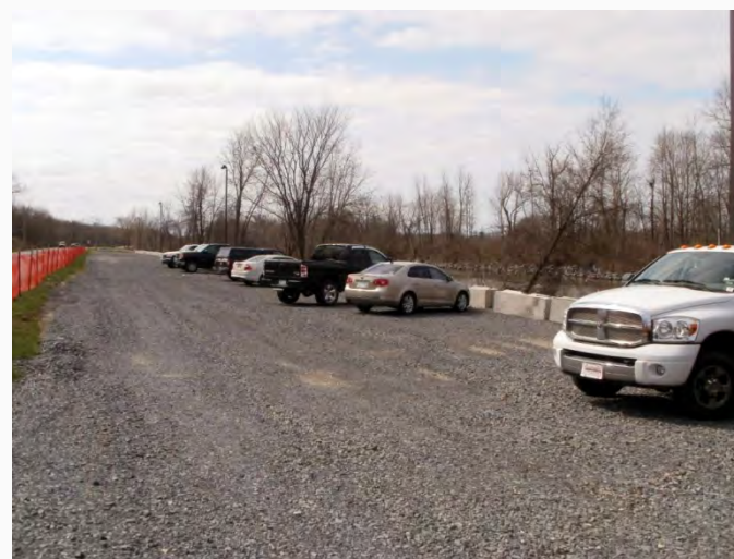
Route 4 Crew Change Area