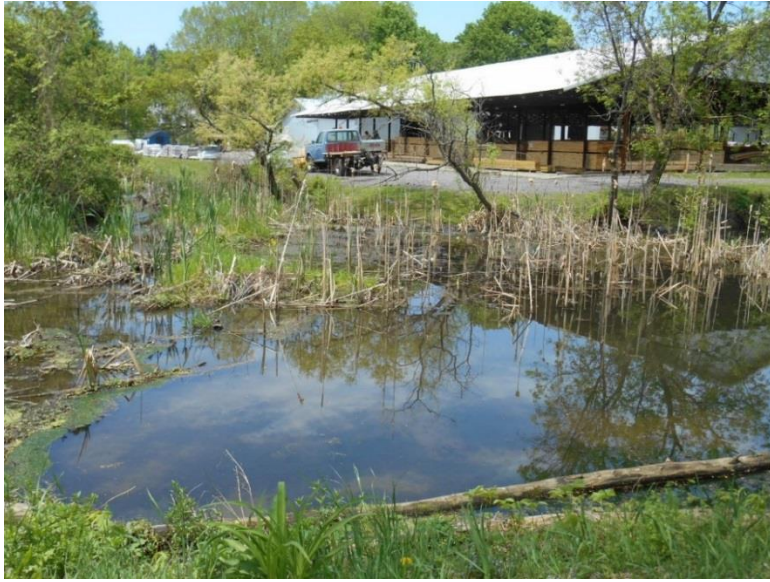
Restricted Canal Flow North of Fort Hardy Park Looking West