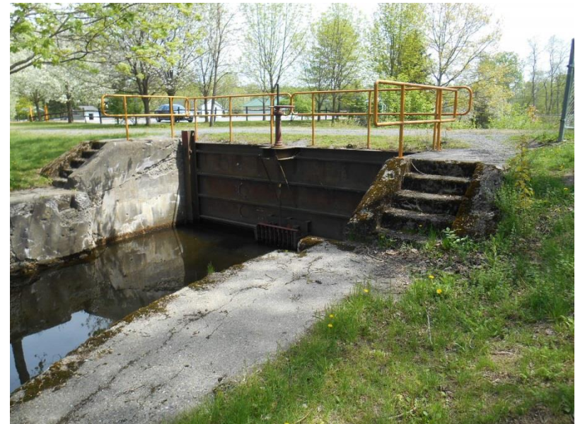
Historic Junction Lock with Restricted Water Flow near Lock 5 Looking South