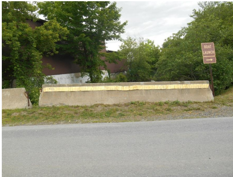
Jersey Barriers above Reds Street Culvert Looking North