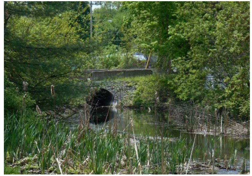
Reds Street Culvert Obstructing Water Flow Looking South