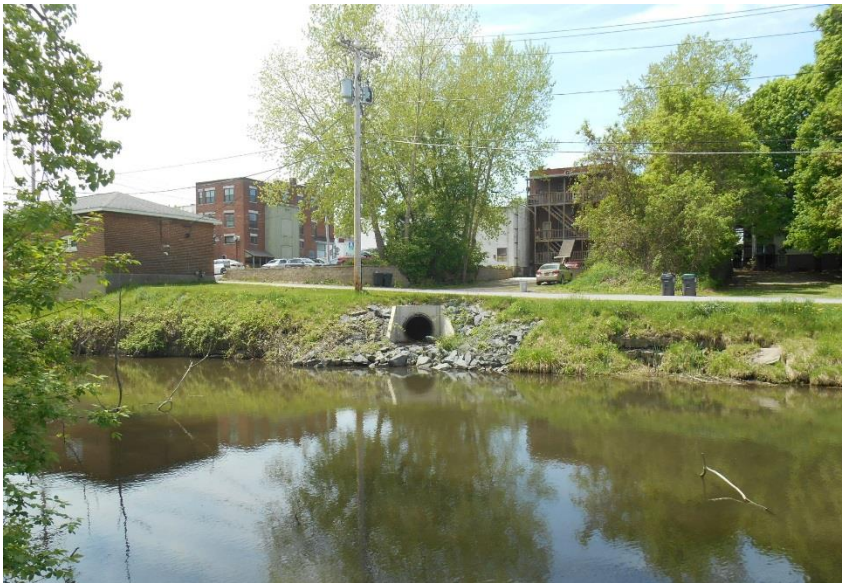
Culvert along Canal Street Looking West