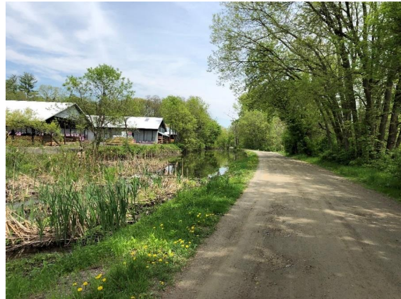
Empire State Trail on Towpath Road Looking North