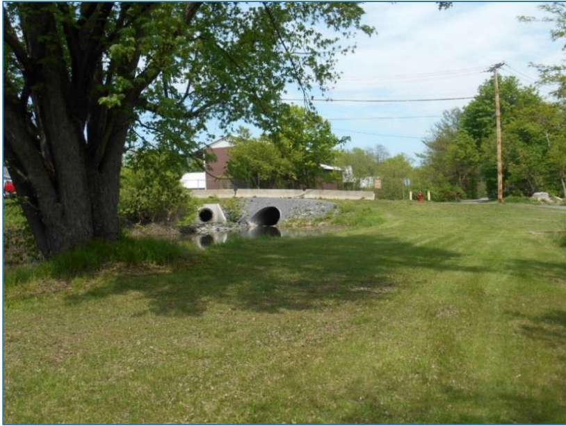
Culvert under Reds Street from Fort Hardy Park Looking North